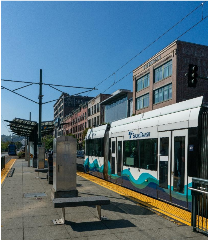
IMAGE 3: One of the many bus stops near the UWT campus that services multiple bus lines, all of which you can take with your U-PASS.