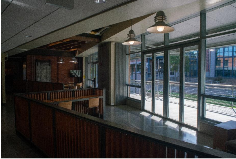
IMAGE 7: One of our campus's many study areas located in Joy building.