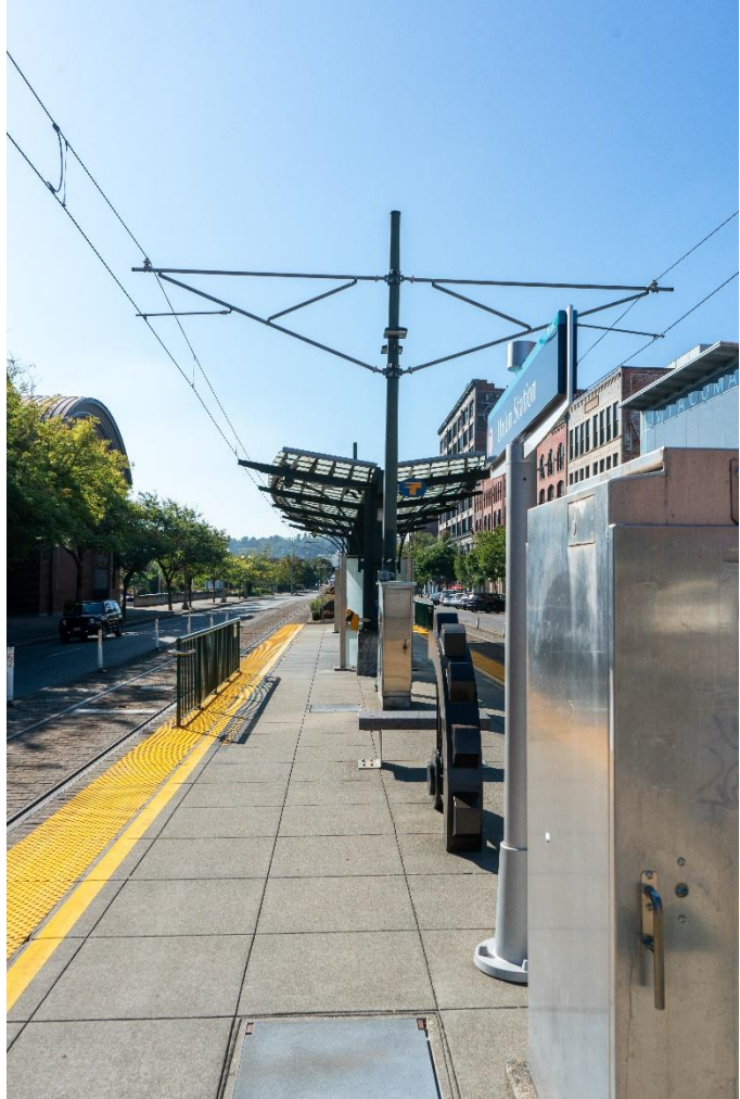
IMAGE 4: Running since the late 1990s, the T Line allows for quick travel throughout downtown Tacoma.

According to an article from King 5, trains for the T Line will now run Monday through Friday from 5 a.m. to 10 p.m., Saturday from 7:20 a.m. to 10 p.m. and Sunday from 10 a.m. to 6 p.m. Trains will run at 12-minute intervals Monday to Saturday from 6 a.m. to 8 p.m. and at 20-minute intervals all other times.