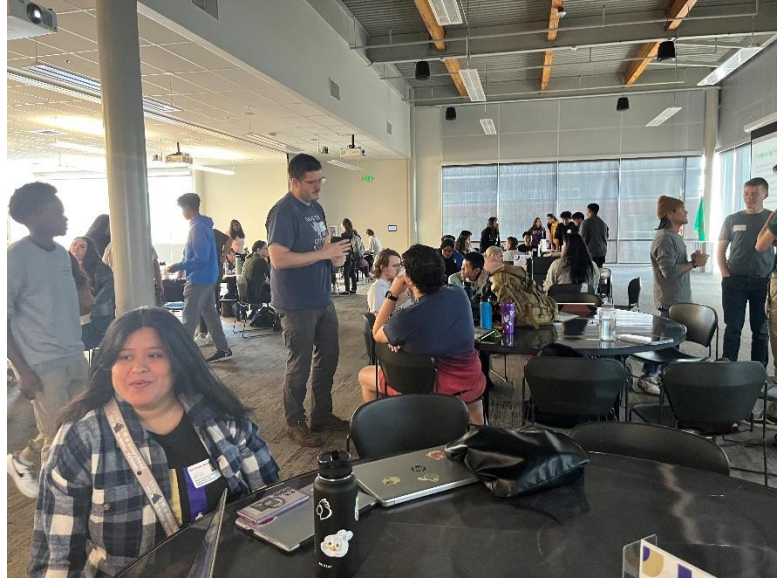
IMAGE 8: Student club officers chatting with each other at RSO event.

Students can explore their interests and identity through UWT's dozens of Registered Student Organizations.