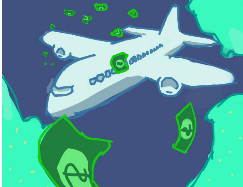
IMAGE 2: Students often face problems with affording Study Abroad programs. Illustration by Cole Martin.

https://www.tacoma.uw.edu/home/events-calendar?trumbaEmbed=view%3Devent%26eventid%3D169778344