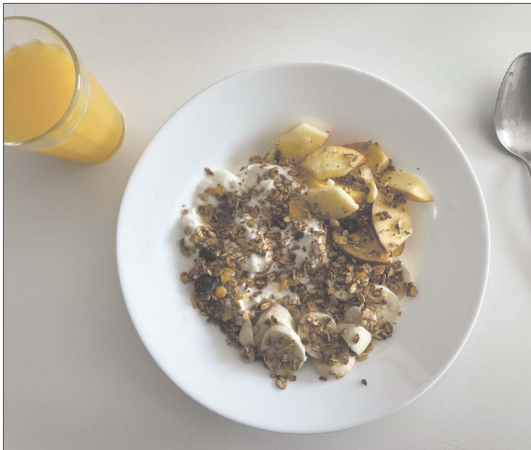
Summer recipes can be lazy, but that doesn't mean they aren't tasty.

Ingredients: Yogurt of your choice (I like the Honey Vanil-