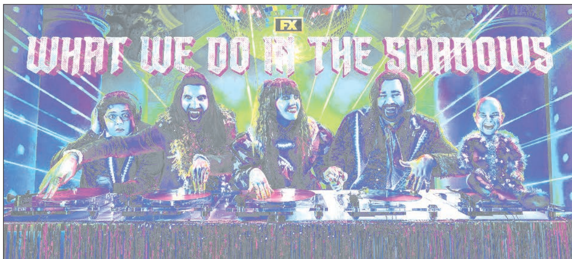
Harvey Guillén, Kayvan Novak, Natasia Demetriou, Matt Berry and Mark Proksch in "What We Do in the Shadows"

This mockumentary-style comedy, based on the 2014 Taika Waititi movie of the same name, follows four vampires and their human familiar living together on Staten Island. This is the closest to a traditional sitcom on this list. It brings a perfect blend of episodic storytelling and season-long narrative arcs between characters with impeccable chemistry. With the fifth season premiering in July, now is the perfect time to get caught up.