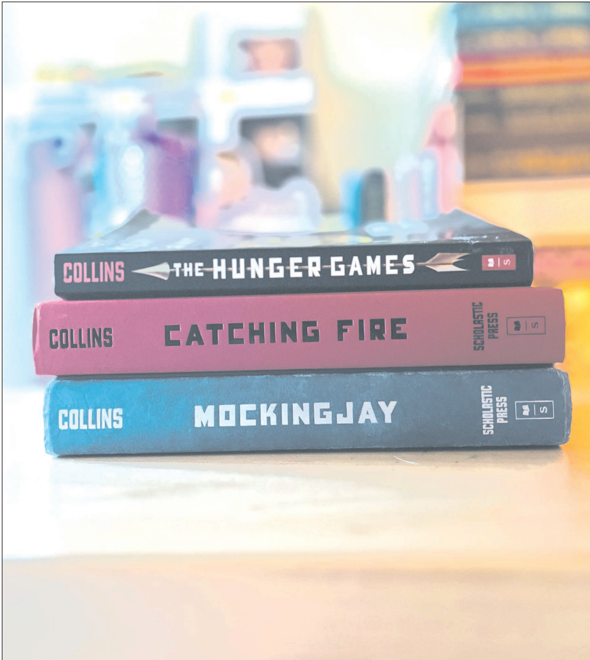
The trilogy that started it all.

The newest addition to The Hunger Games film series is set to be released in November 2023, what does this mean for dystopian novels and films?