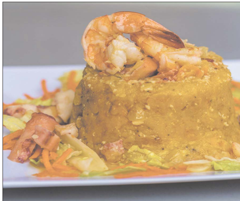
A dish of Mofongo with shrimp.

You'll certainly feel that love when trying them yourself, I guarantee it.