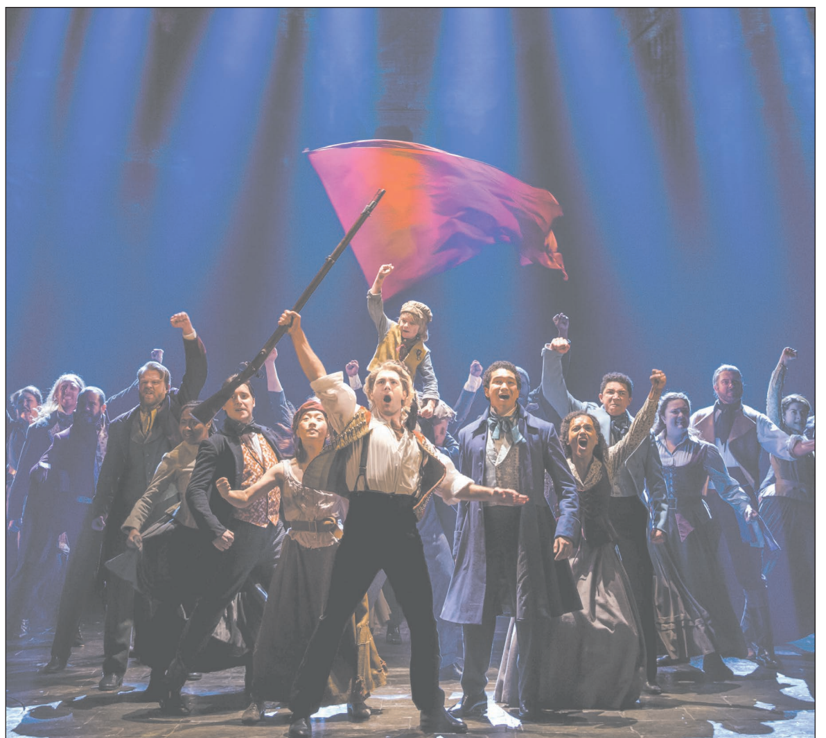
“One Day More” from Les Misérables.

Seattle is full of live entertainment beyond these three recommendations. Theater fan or not, go try something new and enjoy the much needed break!