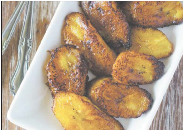
Fried sweet-plantain slices.

Mofongo is perhaps Puerto Rico's most well-known traditional dish, as it dates back to the tainos (our indigenous ancestors) who used mortar and pestles to mash the plantains and make a variety of filling meals. For this dish, make sure your plantain is unripe (green on the outside and white on the inside). Peel and slice your plantain and dump the slices into a bowl of salted water to rest. Fill a pot with oil and heat over medium-low heat. Wait for the oil to warm and dump in your well-dried slices. Wait twelve minutes, or until the plantain slices are light brown.