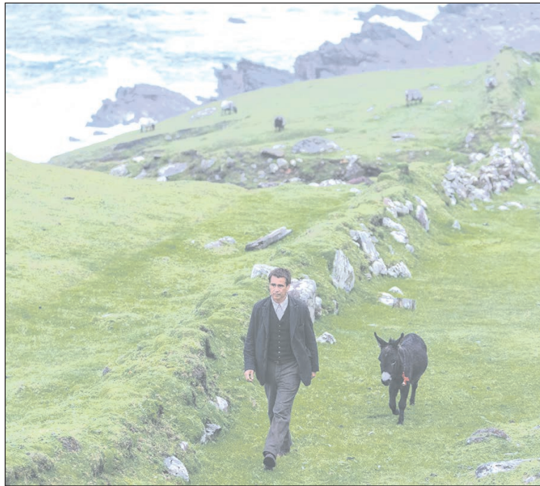
Colin Farrell and Jenny the donkey in "The Banshees of Inisherin"

Some movies this year were very very bad, and some were very very good. Let's leave things on a high note, shall we?