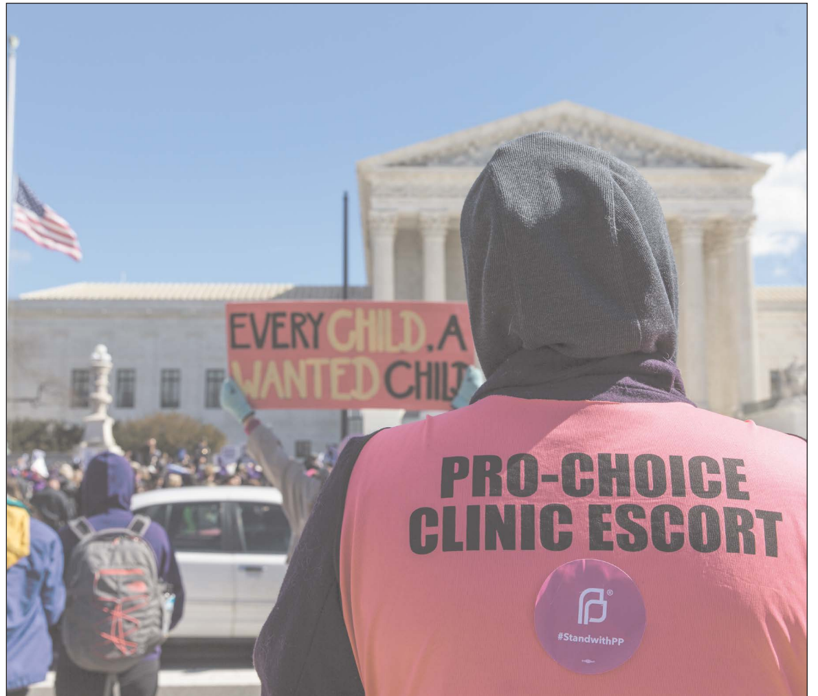
Pro-Life event on UWT campus sparks debate on the ethics of public university space rentals.

"I feel deeply betrayed by my college. During a time period where reproductive rights are in legal peril and people are dying because they cannot access the care they need, UWT has decided to offer up our college campus