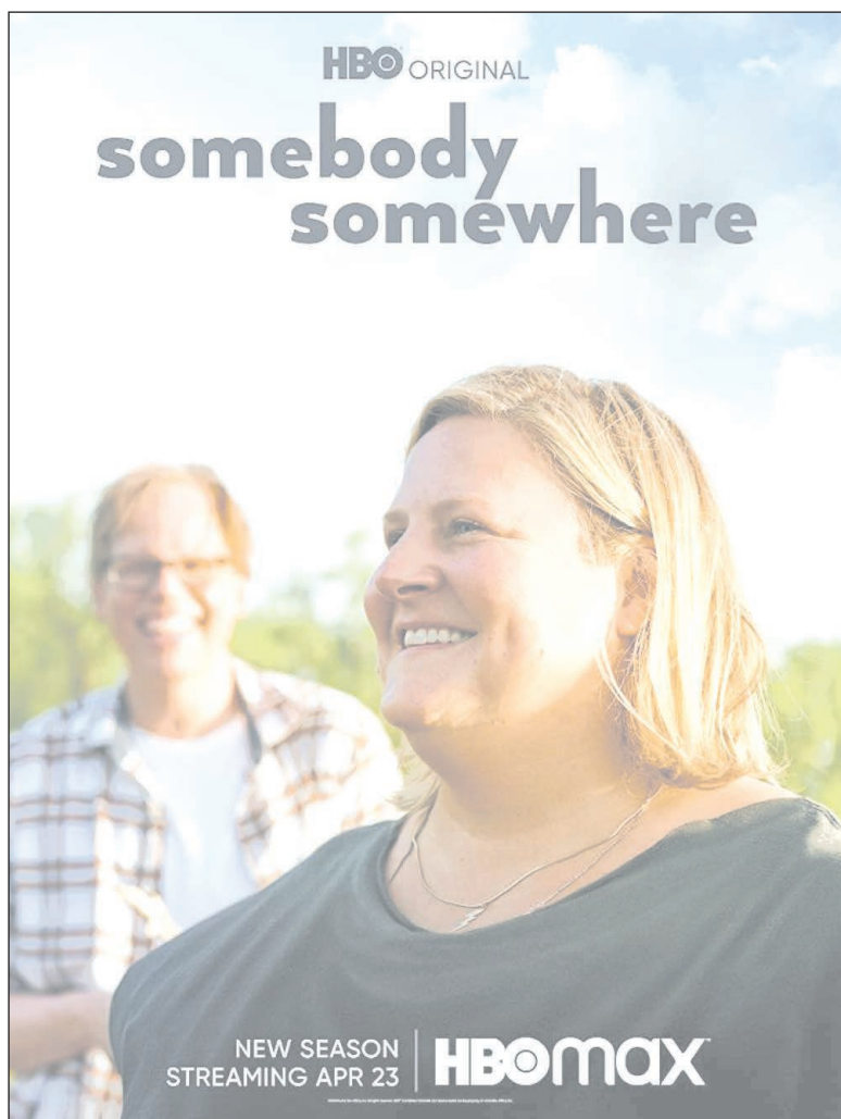
Bridget Everett and Jeff Hiller in "Somebody Somewhere"