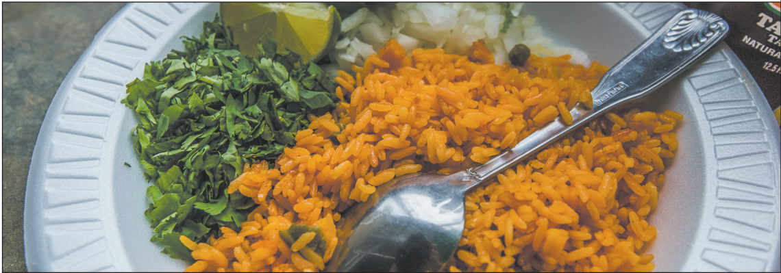
The perfect Mexican red rice recipe.