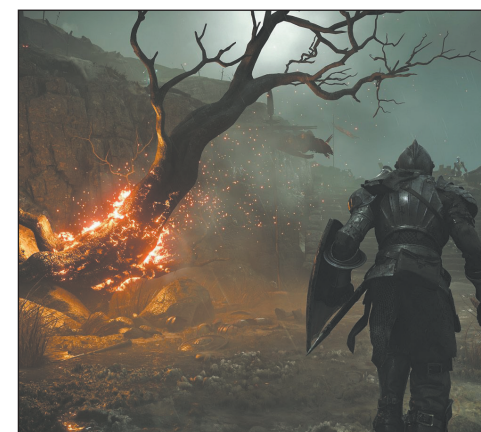
Demon's Souls remaster

As a huge fan of the original franchise made by FromSoftware, I found that Bluepoint did their best to stay as true as possible to the original, and what came out was an enjoyable experience for gamers who are either just getting into games made by FromSoftware or for returning fans who missed out on the original "Demon's Souls." If you are able to score yourself a Playstation 5 please do yourself a favor and check this game out!