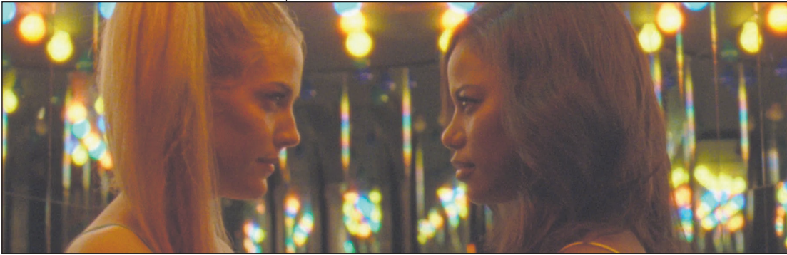
A screenshot from the movie "Zola".

“Zola,” set to be released at the end of June, looks very stylized and has been described as a “surreal” and “wild ride.” From what I’ve seen so far, it is looking to be all of that and more. Look for it in theatres this summer!