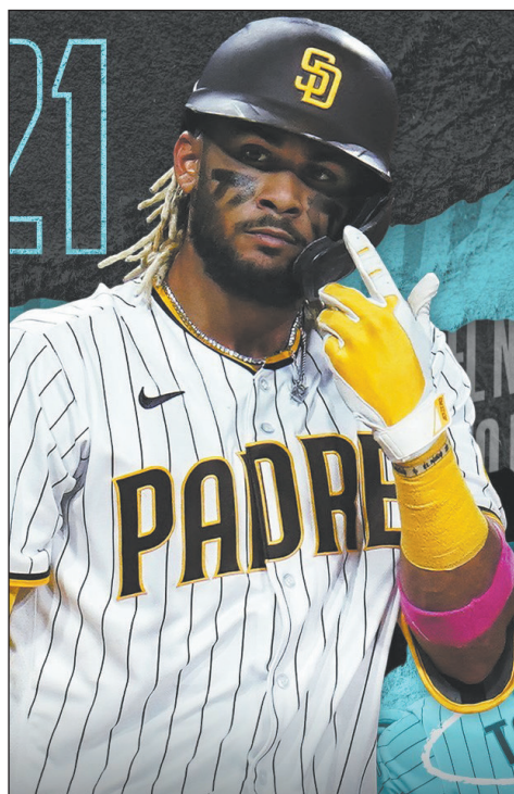
The cover athlete for this year's edition of "MLB the Show" is Padres superstar Fernando Tatis Jr.