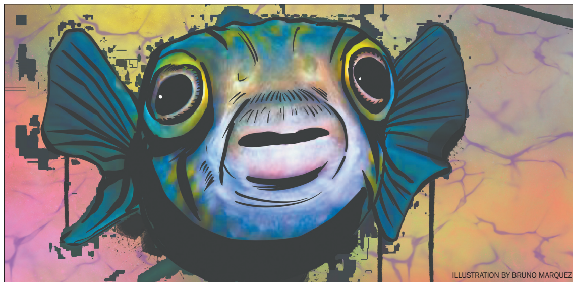
ILLUSTRATION BY BRUNO MARQUEZ

As land creatures, it can be difficult to assess the damage an acidic ocean poses on ecosystems and — inevitably — ourselves. However, in an effort to support our global and local fisheries, as well as protect marine life, we need to become aware of OA impacts.