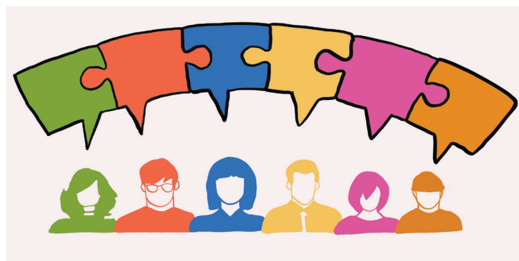
ILLUSTRATION BY BRUNO MARQUEZ

A: My definition of an effective diversity course is based on research conducted by practitioners and scholars in the field, and the counter-hegemonic narratives of those whose very lives we are moving from the margins to the