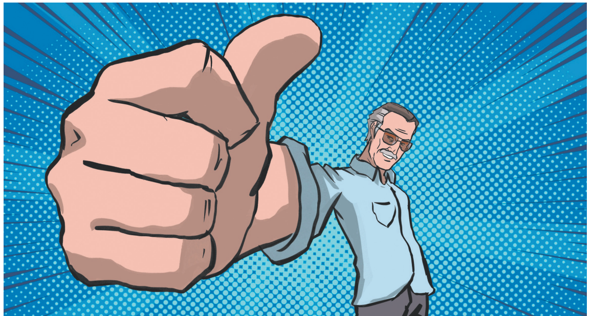
ILLUSTRATION BY BRUNO MARQUEZ