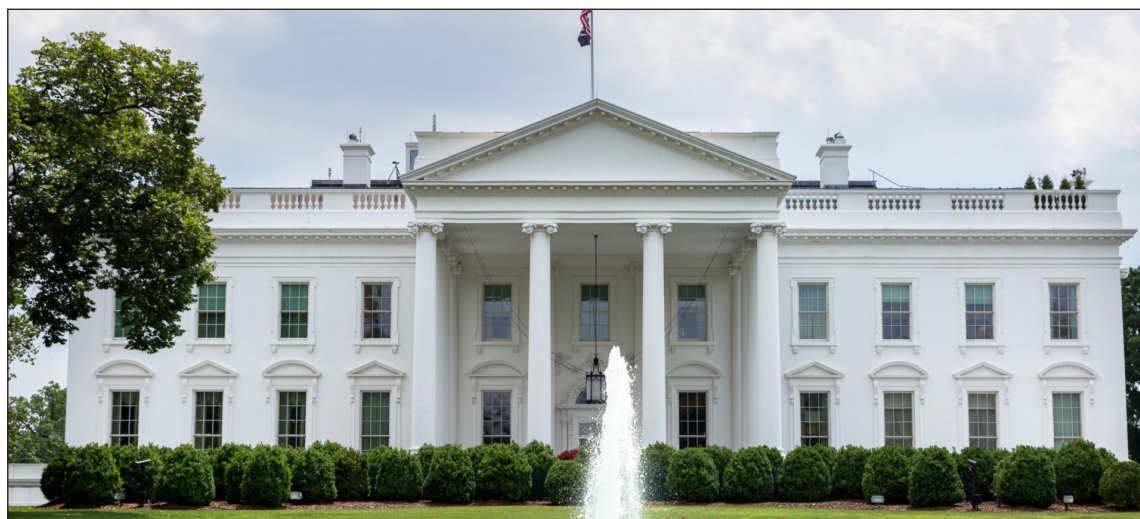
Executive Order 13950 deals with racial scapegoating and racial stereotyping.

Critics of Executive Order 13950 state the order overreaches in what is