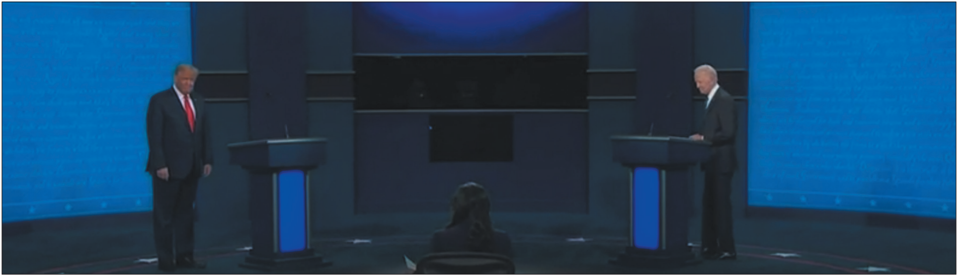
The final presidential debate took place on the evening of Oct. 22.